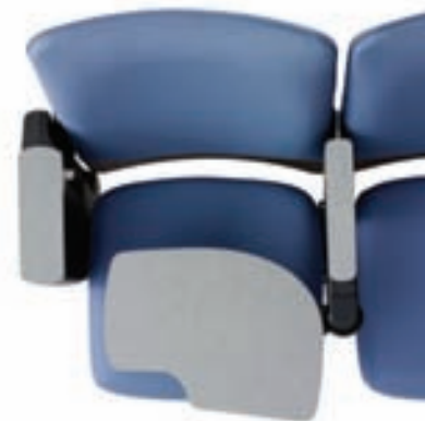
X-Large (151 sq. in.)

The flexibility of the 4C chair platform extends to its accessories and none illustrate this better than our new tablet arm assembly. Available in four sizes, this tablet arm features a built-in anti-panic mechanism for quick, easy storage under the armrest and a distinctive feature that allows the user to move the tablet in or out to place the tablet in a comfortable position. While these features are truly unique, they mean nothing if the assembly is not durable. Based on our testing we know of no other self-storing tablet arm as strong as this one.