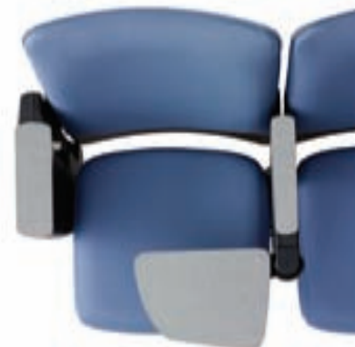
Small (83 sq. in.)